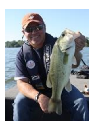
PIB Largemouth bass