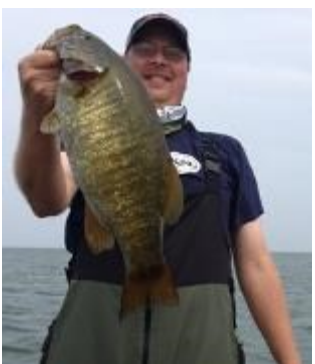
Over four pounds each